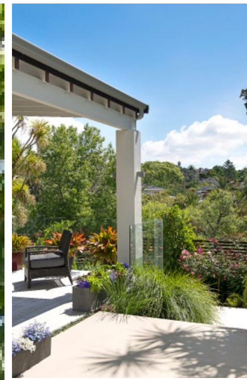
This photo A glass balustrade shelters the main terrace area, which steps down to a side path lined with weeping mulberry trees and roses. Top right Steps from the rear of the house lead to the side path and sunny front terrace. Middle right Astilbe and hellebores are planted in shaded areas. Right Mature trees in a neighbouring reserve give the garden a leafy backdrop.

Text by Carol Bucknell .